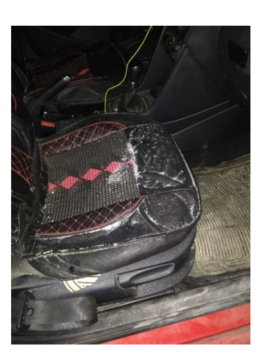
Pictures of the attacked and damaged car, which Hisham was driving when the settlers attacked

Similarly, on 6 September 2020, at around 3:00 am, a group of settlers from Yitzhar settlement attacked resident's vehicles in Huwwara village, south of Nablus city. The incident was fully filmed with surveillance cameras at the location. While the family of Malik Ahmad Mahmoud Sa'ada were sleeping in their house, which is located near the Huwwara Country Swimming Pool, west of Huwwara village, a group of eight masked settlers, dressed in civilian clothes, arrived, on foot, at the family's yard. One of the settlers damaged the rubber tires of the family's vehicle, which is a 2014 Hyundai Accent, using a sharp tool. Then the five settlers surrounded the car, which was parked under the children's bedrooms, and started throwing stones at the front and rear windshields.<sup>45</sup>