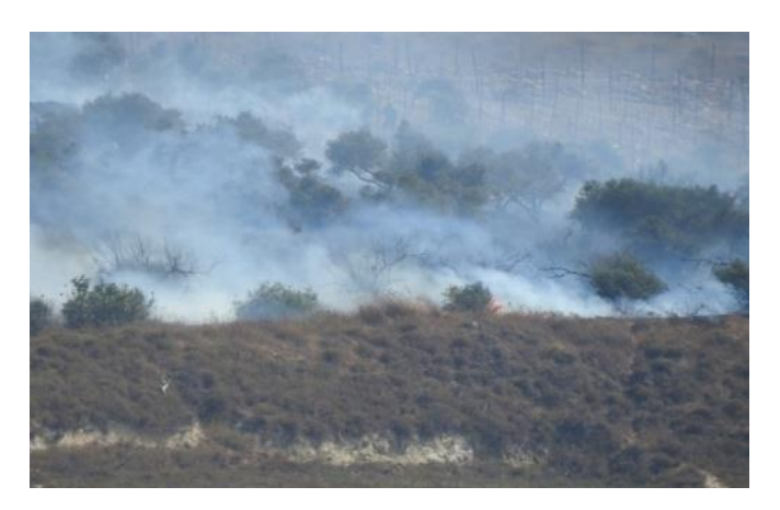
Agricultural lands and trees burning after Yitzhar settlers set up a fire in Ammar's lands

"Immediately after I found out about the fire, I drove an agricultural tractor to the area. I arrived after about five minutes. When I arrived, I saw about 40 Israeli settlers from the Yitzhar settlement, with tractors, accompanied by around six Israeli soldiers, wearing their military uniforms, standing on a hill around 50 meters away from me and watching the fire that is eating our agricultural lands and olive trees. The hot weather and wind contributed to the spread of the fire through the dry grasses and the olive tree. Once I got to the land, I began to extinguish the burning fires... but it was big and difficult to control on my own. During [my attempts to control and put out the fire], young people from the village came to help. The occupying soldiers and the settlers, who were just looking and watching what we are doing, did not interfere. I also notified the Palestinian Civil Defense and a fire engine came. Due to the bumpy road, the fire engine had to stop at Bourin Street, but some firefighters came and helped us put out the fire." 36