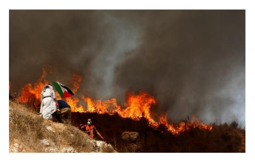
Palestinians withdrawing from the peaceful assembly in 'Asira al-Qibliyya after settlers started a fire - Ayman Noubani © 2020

As the protesters resisted the guard's harassment, the IOF fired tear gas canisters and sound bombs to disperse the protesters, leading to tens of injuries from suffocation, outbreak of fire in the dry uncultivated land, and the forceful suppression of the peaceful assembly. Under the protection of the IOF, the settlers proceeded to attack the protesters with stones and sticks.