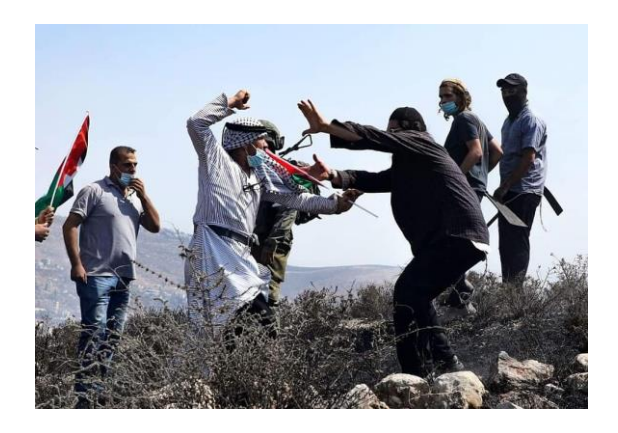
Israeli settlers attacking a Palestinian and trying to take his flag

Organised by the Colonization and Wall Resistance Commission, and the residents of the village, the assembly aimed at standing in solidarity with the farmers and confronting frequent attacks by settlers and the IOF on the village. At approximately 10:30 am, around 50 participants arrived, carrying Palestinian flags and chanting slogans protesting colonisation and assuring the Palestinian identity of their land against threats of confiscation by Israeli settlers. The participants proceeded with their peaceful assembly and started planting olive trees. At 11:00 am, the participants were disrupted by a group of 20 Israeli settlers and the guard of the Yitzhar settlement, accompanied by another 30 Israeli occupying soldiers.