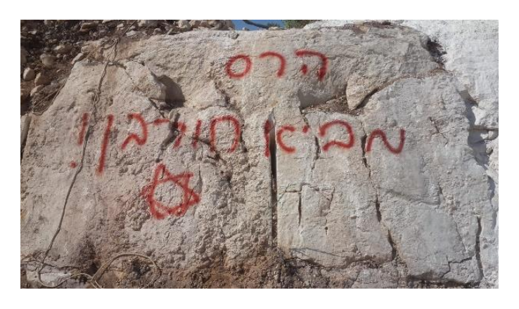
The graffiti that reads "demolition leads to ruin" which was found in the targeted quarry (source: a resident of 'Asira al-Qibliyya)

"I inspected the site and saw Hebrew graffiti written in red. After translating it, it stated that 'demolition leads to ruin'. Next to this graffiti, I also saw the Star of David. I linked this attack to Israeli settlers of Yitzhar settlement, which is one kilometre to the north of the quarry, because such attacks on quarries in the area have been repeated. Settlers who call themselves "Paying the Price Group" previously burned a bulldozer in my quarry in 2018. The attack comes after the occupying soldiers and the Israeli police attempted to evacuate and demolish a settlement outpost and caravans inside Yitzhar settlement on 12 August 2020. This means that the attack that we were subjected to by torching the excavator is a retaliation from these settlers."