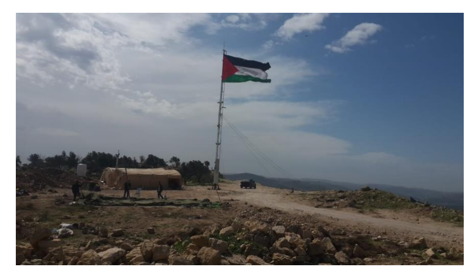
Jabal al-Arma, close to where Mohammad was shot and killed (11 March 2020)